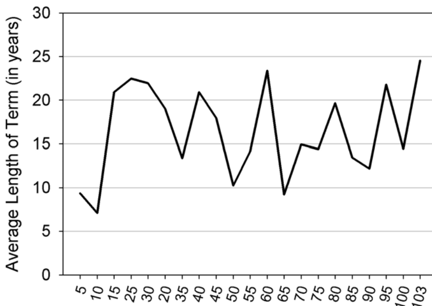
Chart 2 Average Length of Term, in Groups of 5

An even less convincing argument, closely related to the “dramatic recent increase” claim, is that the length of tenure today has disrupted the expectations of the founders. Calabresi and Lindgren argue that improvements in medicine and increases in average life expectancy have caused a fundamental change in “the real-world, practical meaning of life tenure,” 165 producing a system that is “very different now from what it was in 1789.” When the Federalists and Anti-Federalists discussed their expectations, however, they contemplated even longer tenure on the courts than we have seen to date. Federal Farmer No. 15 complained that judges with life tenure would serve “thirty or forty years.” 166 Meanwhile, Hamilton in The Federalist No. 79 assailed New York’s mandatory retirement age of sixty for judges on the grounds that “[t]he deliberating and comparing faculties generally preserve their strength much beyond