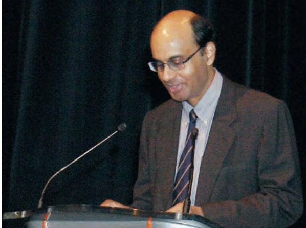
Tharman Shanmugaratnam, Minister for Education and Second Minister for Finance of Singapore, delivers a keynote address at a session held at the National University of Singapore.

be measured by more than income growth, with an emphasis on capabilities. Indeed, if we define poverty in terms of “wealth” (a certain level of assets for investment in life goals), we find a much starker picture of poverty and inequality within and between countries; wealth inequality far outstrips income inequality in the vast majority of countries. Framing the problem in terms of assets means finding solutions in terms of assets. As this trend continues, it will have huge implications for programming and policy.