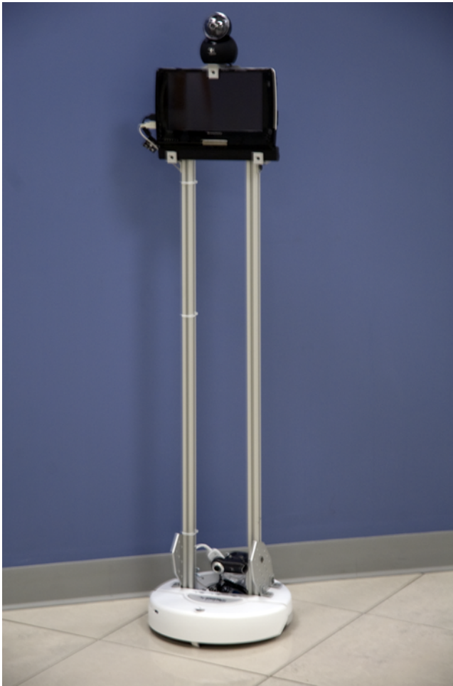
Fig. 1. A full view of the robot.