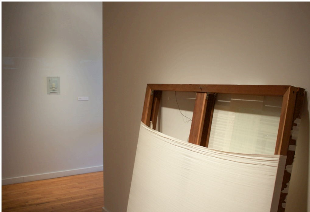
Figure 1 Rebecca Lothan, The Angle of Repose (installation view at BFA thesis show), 2015

In a lot of ways I feel like this text could be a manifesto of sorts; a distilled text that describes how I feel about objects. So much history is wrapped up in them, and imagined narratives follow. Kabakov goes on to argue that unsorted garbage is a truer archive of our daily lives, making the claim that the dump can be viewed as the most honest cultural archive. The huge amounts of detritus that we accumulate each day, compared to what we consciously keep to surround us, provides a truer portrait of how we view our objects, something equivalent to a portrait en medias res.