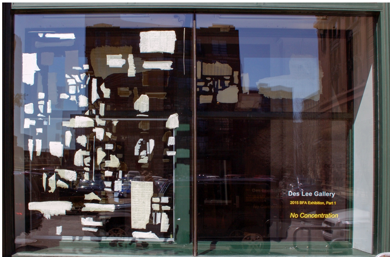
Figure 5 Rebecca Lothan, But When , 2015, tape and glass

Collecting as a studio practice is also incredibly important to Gedi Sibony, another aspect