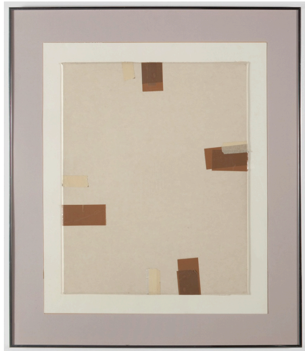
Figure 7 Gedi Sibony, Untitled , 2011, Frame

In The Angle of Repose tape serves a function, to hold up the glass, it acts as the surface, and the glass, as a material. The tape and the glass are framed by a quadrant of the stretcher. The tablecloth is only stretched halfway across the stretcher. In making this work very much about revealing the functional support that typically is covered by the primary image to be considered. I am giving primacy to the support, and in this way these works situate themselves in Robert