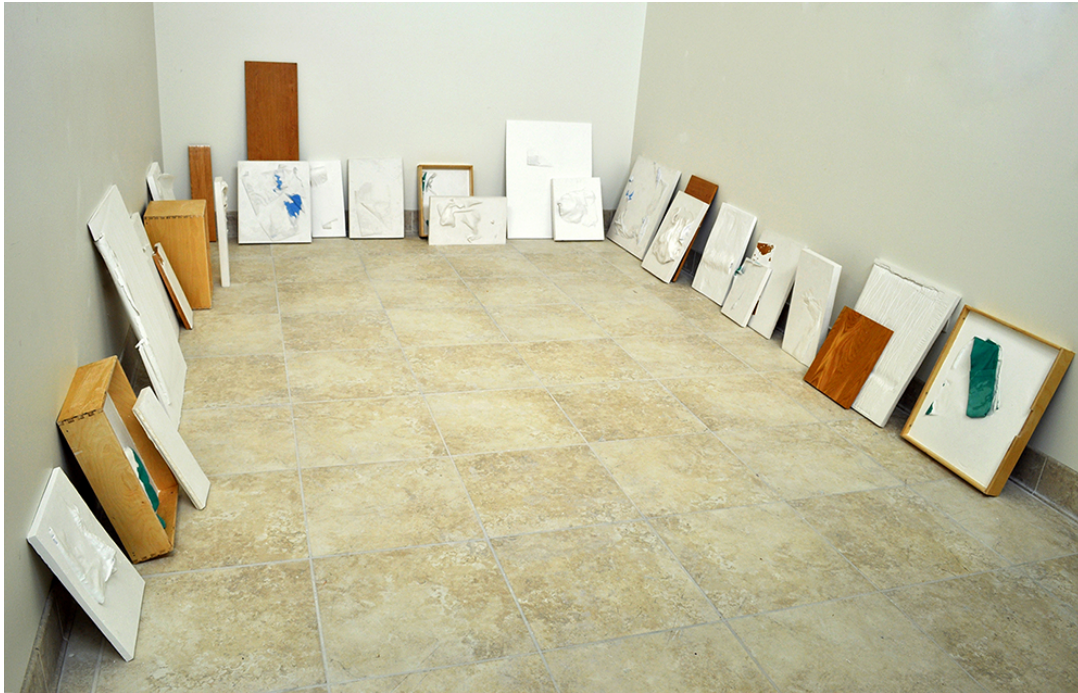
Figure 3 Rebecca Lothan, The Line Up , 2014, Plaster, scrubs, hospital gowns, disassembled wooden dorm desk

collection serves to forge a removed connection between viewer and inmates through the creation of the collection, through a shared attention to objects.