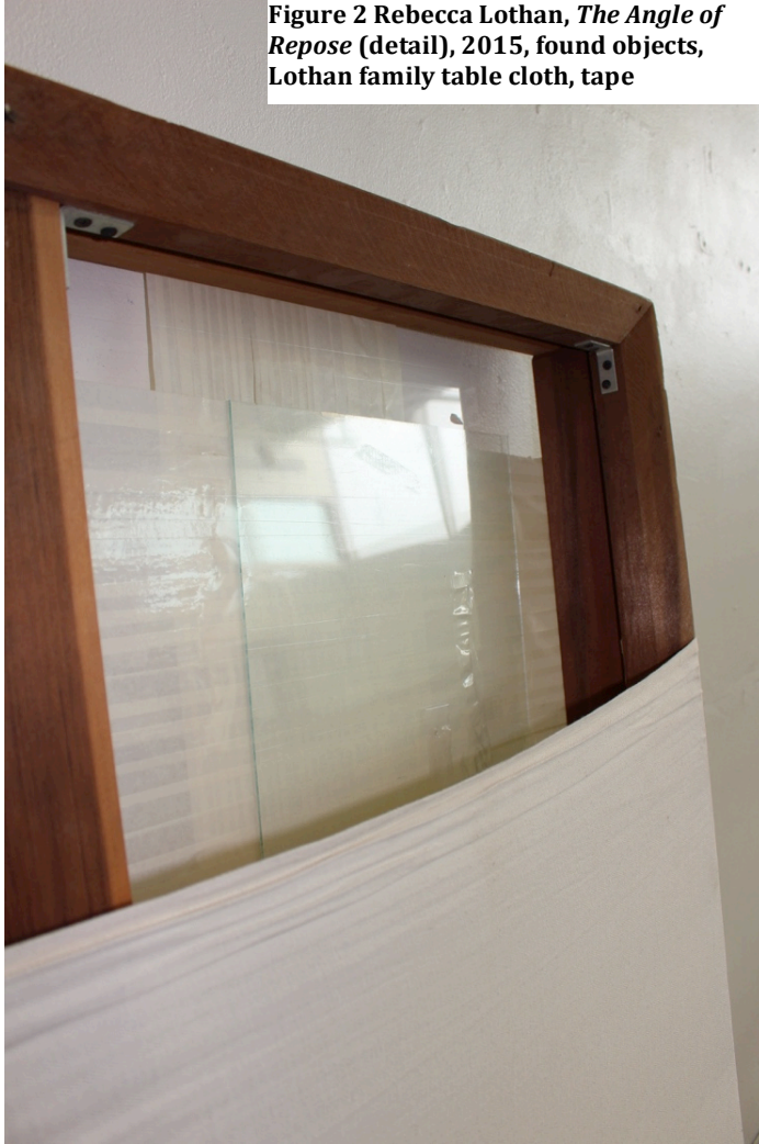
Figure 2 Rebecca Lothan, The Angle of Repose (detail), 2015, found objects, Lothan family table cloth, tape

highlighting the unique material qualities, and also by robbing each everyday object turned material of their utilitarian function.