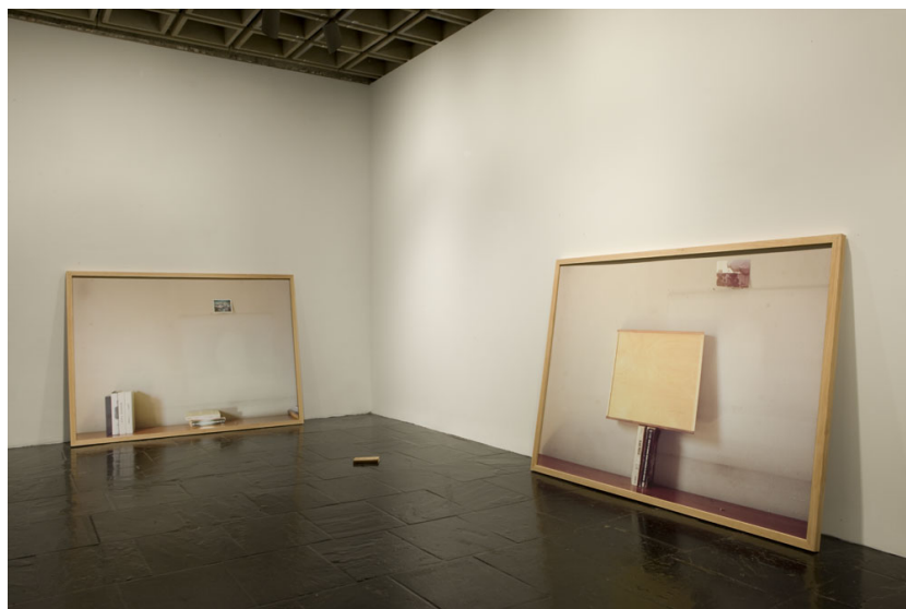
Figure 4 Leslie Hewitt, Make it Plain, 2006

almost intolerable it was so rich and bright; the same was true of the most ancient and most trivial memories. A little later he realized he was crippled” (Borges 112). Borges’ story, describes an extreme change in perception, or an extreme sensitivity to perception, where all perceptual information is non hierarchical, realizing he was crippled came a little later. To Funes, each bit of perceptual information was so new, fantastic and singularly memorable, that it could not be grouped, generalized or extrapolated from; learning was no longer possible for Funes. An element of this perceptual chaos described contributes to my personal narrative and interest in this topic; something of Funes’ perception reflects how I take in sensory information, all at once, without hierarchy, my tag in my shirt competes with Microsoft word. I am often overwhelmed by a deluge of information, just being in the world requires a slowness, in this slowness encompasses something of what I want the viewing experience of my thesis work to reflect. In my thesis work, in its in-between-ness I want to function in a similar way with a step removed, to require a slowness of viewing, and also point to the act of perception. Heightened perception and sensitivity to objects that directs the process of collection; I want the viewing experience to mirror the creating process in this way. Leslie Hewitt is an artist that I look to in this respect.